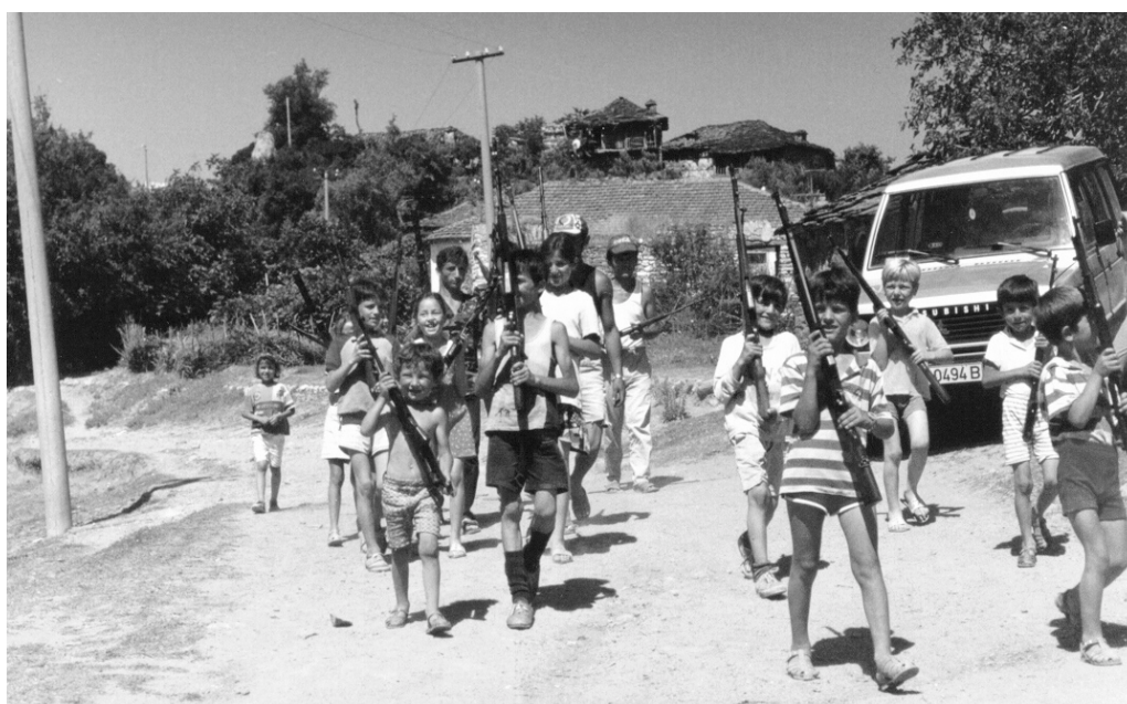
On the path to peace: children from Gramsh province, Albania, taking their fathers' rifles to the collection station.

An interesting approach is being pursued by the weapons collection project in the Albanian province Gramsh. In 1999, at the request of the government in Tirana and in close cooperation with the local authorities, the UNDP and the UN Department of Disarmament Affairs (DDA) collected some of the weapons misappropriated from government storage facilities in 1997. The novel aspect of this project was that those handing in weapons received no individual reward - to avoid the impression that stealing government property and the ownership of illegal weapons are profitable for those involved. This model provided no extra impulse to the market for weapons through the purchase of small arms. Instead, the villages and areas handing in the weapons were rewarded: roads were built and telephone lines installed, street-lighting improved in the provincial capital, and the chief of police received three vehicles and mobile radio transmitters. This considerable success has however been overshadowed by the government's failure to keep its promise to destroy a significant portion of the weapons.