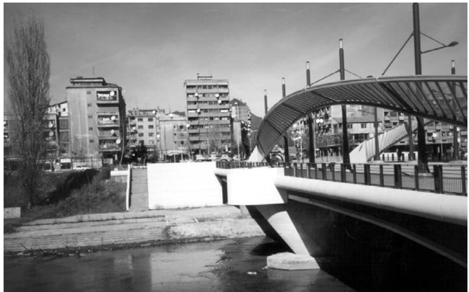
Bridge over the River Ibar linking North and South Mitrovica

BEYOND ISSUES RELATING TO THEIR DAILY SURVIVAL , the Kosovo Serbs are deeply concerned by their insecure status within Kosovo, by the fact that IDPs have not returned and more Serbs continue to leave, and by the uncertain future of their community. Such issues dominate their politics, which revolves around the degree of co-operation which should be given to the international administration, and how the Kosovo Serbs should relate to politicians in Belgrade. To some extent, political cleavages divisions among Kosovo Serbs run along similar lines to those within Serbia. However, there is an additional split, reflecting the differences in lifestyle between those in the North and those in the enclaves in the rest of Kosovo.