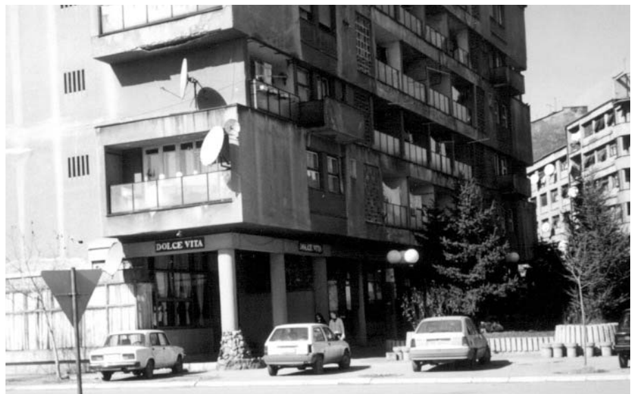
Dolce Vita café in North Mitrovica