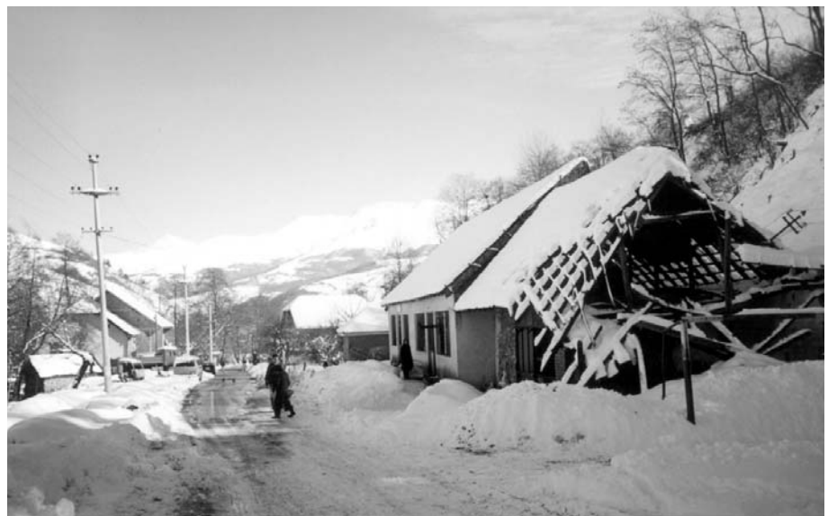
Village in Strpce

THE CONFLICT BETWEEN SERBS AND ALBANIANS in Kosovo in the 1990s, which ultimately triggered NATO's military actions against Yugoslavia and the creation of a protectorate in the territory administered by the United Nations Mission in Kosovo (UNMIK) has deep roots in the history of South Eastern Europe. While the name 'Kosovo' entered the realm of history only in the 1870s and the current administrative borders have existed only since 1945, the area bordering present-day Macedonia, Albania, Montenegro and Serbia proper has been contested by various regional powers for many centuries. Since the end of Ottoman rule over the province in 1912, the competing historic and ethnographic claims of Serbs and Albanians have shaped the political agenda in the region. There is not enough space in this report for an in-depth discussion of the complex history of Kosovo and its 'politicisation' by nationalist historians on both sides during the 19th and 20th centuries. 4 Instead, this section endeavours to give a brief overview of the main historic developments, and describe how they are interpreted by both sides.