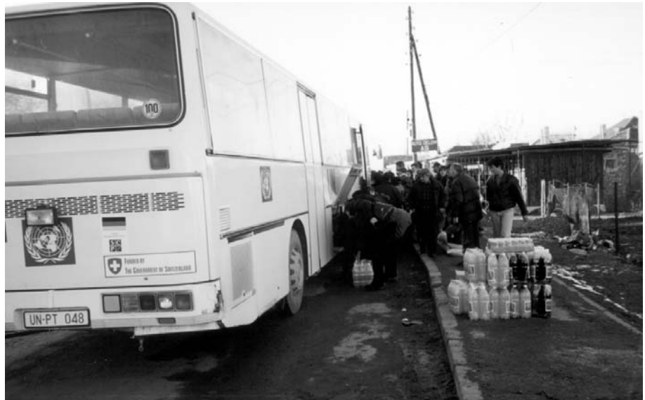
Serbs using 'minority shuttle' bus to move between enclaves

KOSOVO HAS BEEN ADMINISTERED by the UN Interim Administration in Kosovo (UNMIK) since June 1999 under the provisions of UN Security Council Resolution 1244. In January 2002 Michael Steiner of Germany was appointed as the new UN Special Representative of the Secretary General (SRSG), following Bernard Kouchner of France (1999–January 2001) and Hans Haekkerup (resigned in December 2001). The NATO-led peacekeeping force, KFOR, which entered Kosovo after NATO's intervention in 1999, remains in the province. Initially about 50,000-strong (42,500 in Kosovo and the rest in Macedonia), levels were reduced to 38,000 as of June 2002, and on 6 June 2002 NATO Defence Ministers decided in Brussels to cut the force by a further 4,800 by the end of 2002, and then to 29,000 by June 2003. The Commander of KFOR is rotated every six months.