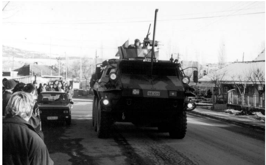
KFOR tank providing protection in Kosovo