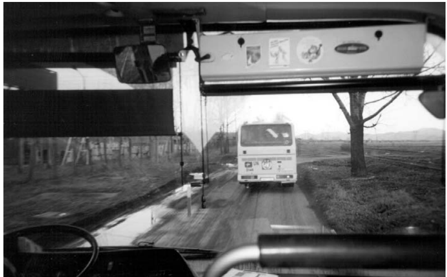
View from 'minority shuttle' bus

IT SEEMS HIGHLY IMPROBABLE that the existing arrangements in Kosovo are sustainable, and as international attention and commitment is likely to continue to wane, steps towards a definite and lasting solution need to be taken if the area is not to slide back into violence. Meanwhile, discussions in Kosovo have been overshadowed by the political agendas of radicals on both sides, and by Serbia's often unclear position on the matter. The contrast between the position of international legality and the realities of the ground could not be greater. While the gradual trend towards de facto independence for Kosovo is welcome to most Albanians, in the absence of an agreement on the status of the province ordinary people must live in a political limbo. For the minorities in particular, normal life is on hold as their status is bartered away in an international game of poker.